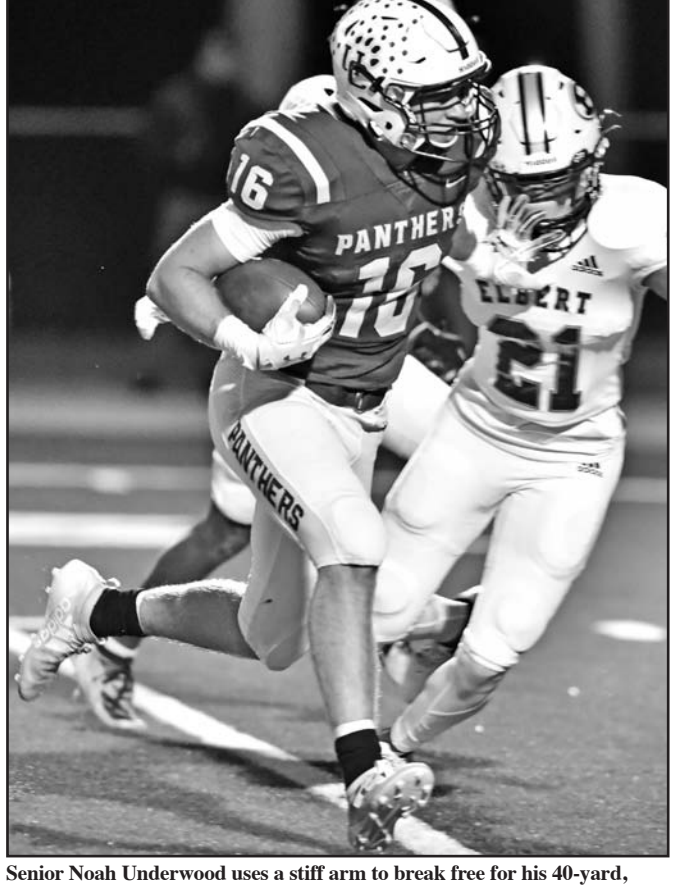
game-tying touchdown reception in the third quarter.

With the goal line in sight, Helcher kept it himself, picking up the first-down yardage before losing the football at the 1-yard